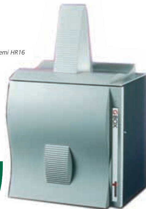
G Box :Chemi HR16